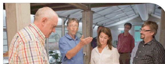
Bill and Melinda Gates visit James Cook University's Mosquito Research Facility

James Cook University's mosquito research facility, uses funds from the Bill and Melinda Gates Foundation towards their eliminate dengue program.