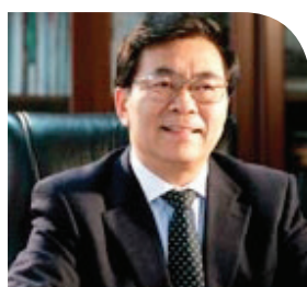
Professor Chunli Bai

“In 2012 Griffith was the first university in Australia to establish a Dual Degree PhD Program with the Chinese Academy of Sciences. Candidates are jointly supervised and are awarded two separate doctoral degrees by the two institutions.”