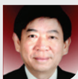
Minister Khaw Boon Wan Malaysia Minister for National Development, Singapore