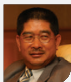
Datuk Dr Maximus Ongkili Malaysia Minister Science Technology and Innovation