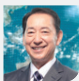
Dr Mamoru Mohri Japan Director, Museum of Emerging Science and Innovation, Tokyo