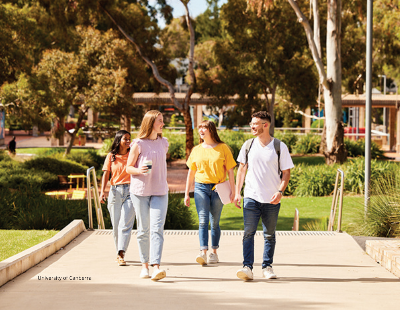
University of Canberra

Flinders University Griffith University James Cook University La Trobe University Murdoch University University of Canberra Western Sydney University